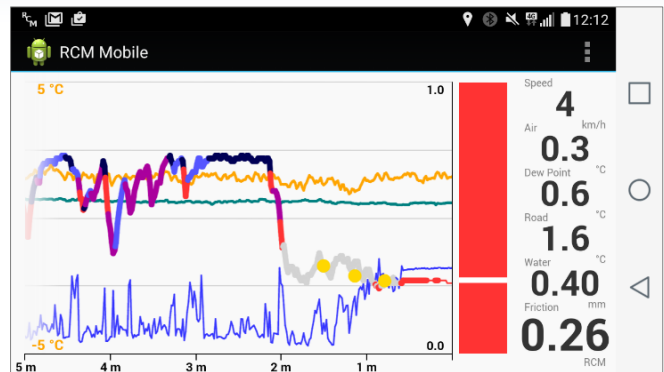
Screenshot of the mobile device user interface with temperature and road condition measurements.